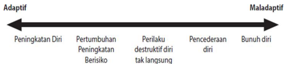
GAMBAR 11.1 Rentang Respons Protektif Diri